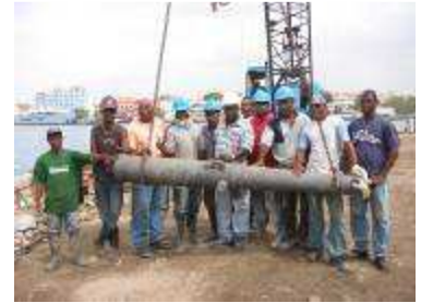
Bronze canon of 1770 found in the harbor of Curacao.

(thanks to Ieteke Witteveen for the information)