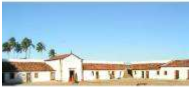
Fort Orange, Itamaracá Island.