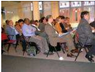
Conference in Amsterdam (GAA) last November

The project 'The Atlantic World and the Dutch, 1500-2000' is hosted by the Royal Netherlands Institute of Southeast Asian and Caribbean Studies (KITLV). The project has been made possible by the Netherlands Culture Fund (HGIS / Ministries of Foreign Affairs / Education, Culture and Science) and by the Netherlands Organisation for Scientific Research (NWO).