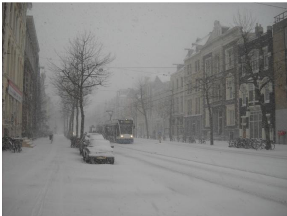
Hotel Eden Lancaster, Amsterdam, on December 1, 2010

Hotel: Eden Lancaster, Plantage Middenlaan 48, Amsterdam